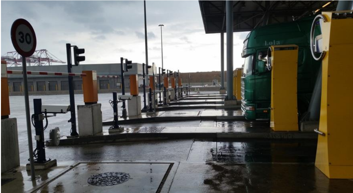
Figure 2 Self-Service Kiosk at Terminal Gates.

Once the drivers arrive at the gate terminal, they type the PINCODEs assigned to the operation they want to perform and also introduce their magnetic card for their identification. Terminals are prepared to handle up to 4 operations (each one with a specific PINCODE) for one truck visit. The lectors disposed also read the truck plate and the container number. After checking all the information in the TOS, the Self-Service Terminal informs the driver where to head the truck and the barrier is lifted.