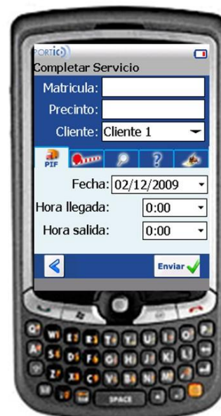
Figure 1 Transportic app – screen for reporting Container ID and seal number.

The PCS automatically forwards the data reported by the truck drivers to the other operators in the chain (customs agents, forwarders, ship agents) for them to update systems and prepare for the next steps in the workflow (customs clearance, shipping instructions,