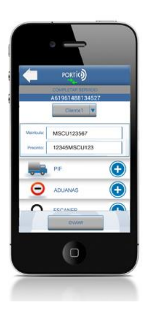
Figure 1 Transportic app – screen for reporting Container ID and seal number.

systems and prepare for the next steps in the workflow (customs clearance, shipping instructions,